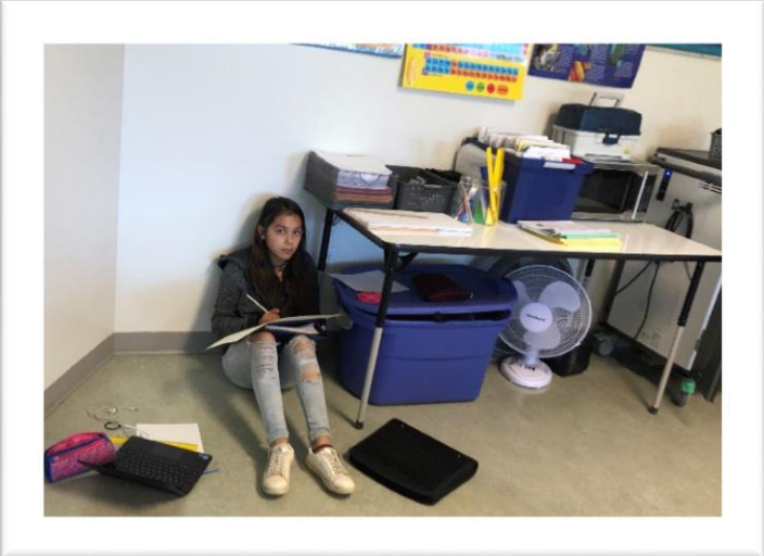
Around the School