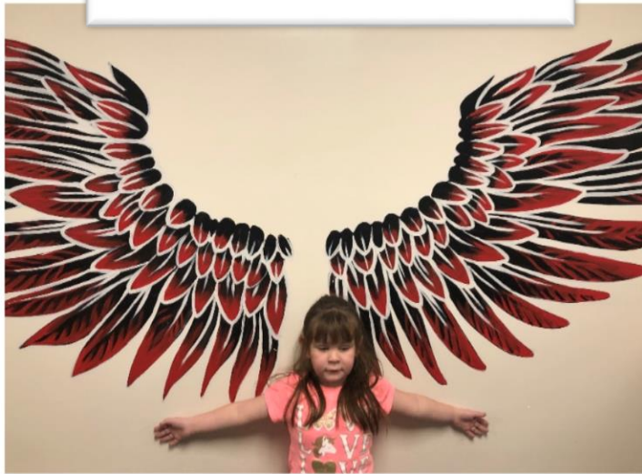
Around the School